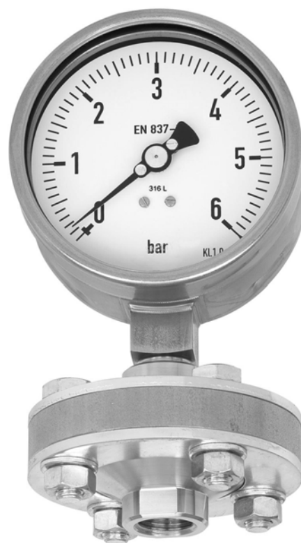
Diaphragm Seal, Threaded Process Connection, Threaded Design Model 990.10, with Pressure Gauge Model 232.50 NS 100

Retainer flange, hexagonal bolts and nuts: galvanised steel max. 200 °C